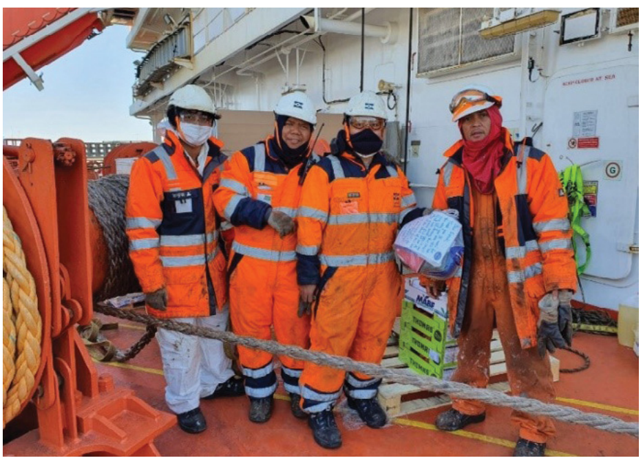
Seafarers delivering essential services.

Emphasis should be given to training seafarers for mental health awareness and resilience. Designated senior crew and masters should be trained in mental health first aid.