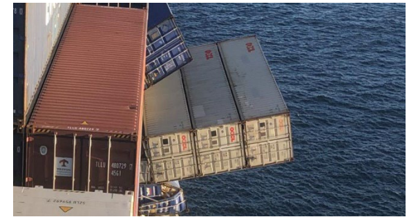
Collapsed containers on board a ship off the Australian coastline