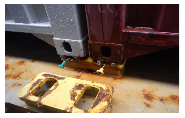
Mixed locks at base of stack

AMSA has recently found instances of twistlocks designed for vertical layering between containers used as base locks even though they were colour coded (Base locks have a larger seat to eliminate lifting forces).