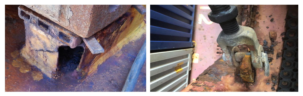
Heavily corroded container securing socket and lashing point

Using heavily corroded fixed or portable cargo securing devices increases the risk of container loss as this diminishes the Maximum Securing Load (MSL).