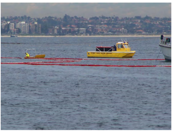
boom deployment on Botany Bay