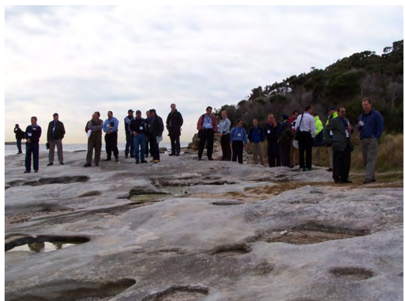
observers maintain vigilance