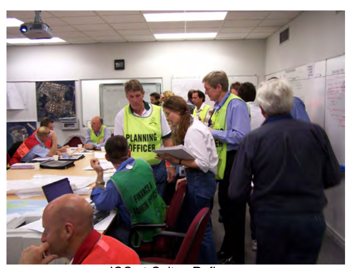
ICC at Caltex Refinery