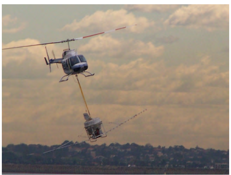
dispersant spraying operations