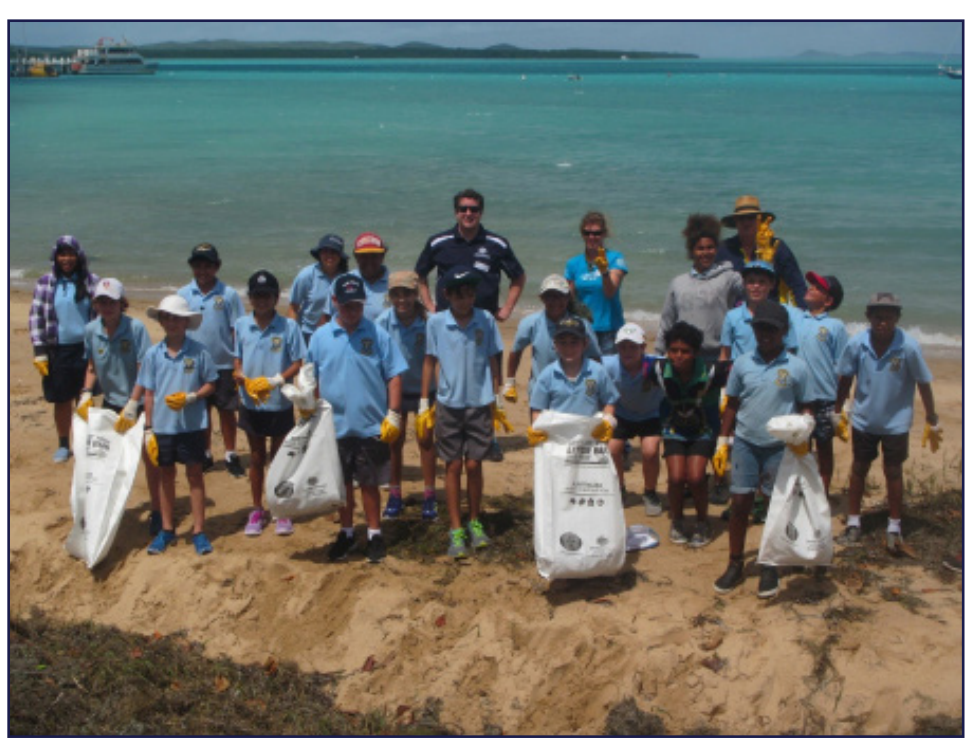
Beach clean-up activity with year 5/6 students from the Our Lady of the Sacred Heart Primary School

Tangaroa Blue is an Australian non-for-profit organisation which coordinates the Australian Marine Debris Initiative. The visit to Thursday Island was the first community education activity AMSA has undertaken in partnership with Tangaroa Blue since our longstanding working relationship was formalised through a memorandum of understanding in May this year.