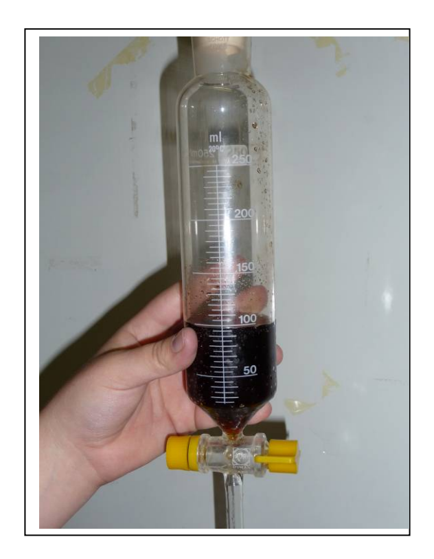
Step 5: Dispersed oil in the separating funnel