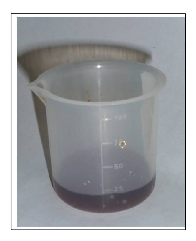
Step 2 : Oil and dispersant mix in the beaker