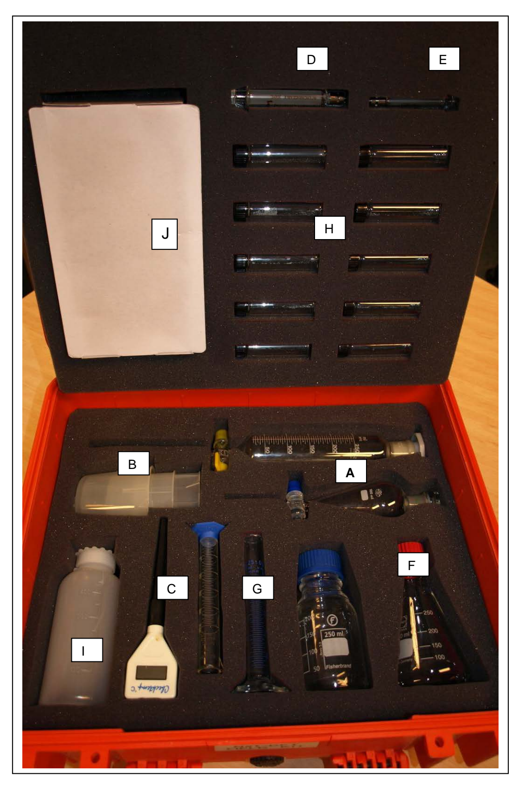
Figure 1 – Contents of National Plan Oil Spill Dispersant Field Test Kit