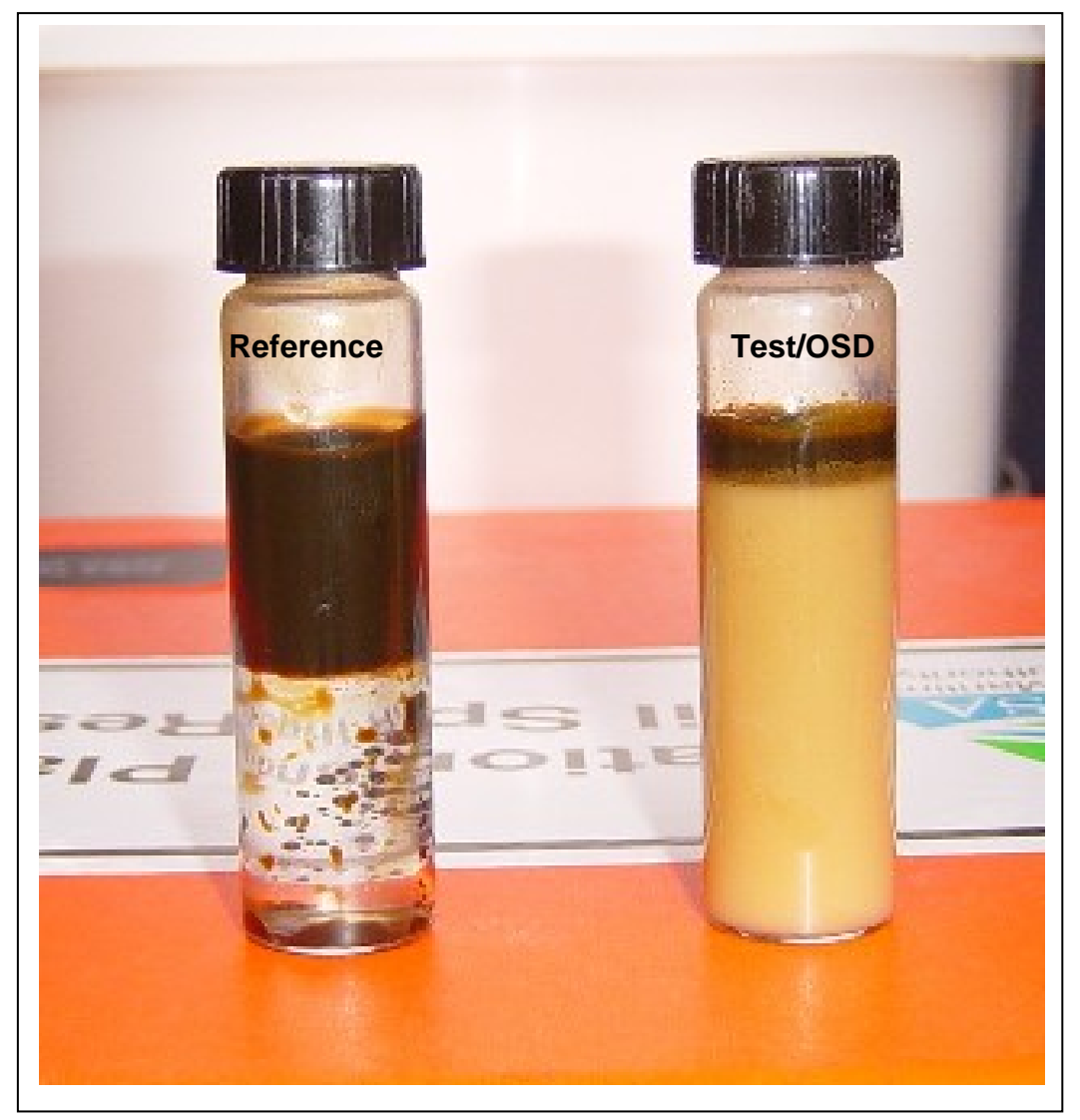
Figure 2 – QET results - comparing the Reference with the Test/OSD

Visually compare the Test Mixture (s) with the Reference solution containing just oil and seawater. If the OSD is effective, you will see the test mixtures will be darker or more opaque than the water in the reference mixture (see Figure 2 below) due to the quantity of dispersed oil suspended in the seawater.